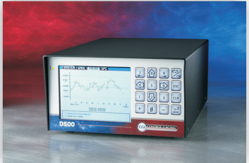
D500 Gage Controller with IPC Trend Page displayed

The Trend Page is the heart of the IPC. It shows a real-time X-bar and R chart with additional features that make the size trend, the actions of the gage system, and the response of the machine all “visible” to the user at a single glance.