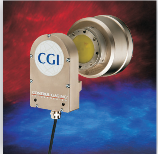
Balancing head with contactless transmission

The power and logic signals are transmitted through an air gap, allowing the FTC Balance Heads to operate at higher wheel speeds. These heads also have an exclusive zeroing cycle to neutralize the position of the weights. This is useful during machine startup or after a grinding wheel change.